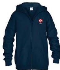
YOUTH ZIP UP HOODY

Spirit Wear Orders: We have had a few inquiries into the possibility of ordering spirit wear hoodies. If there is enough interest we can place an order. Hoodies are $38 each, including tax. Please let us know at the office if you would like to place an order. Email office@shsdelta.org If we have enough interest we will contact you in regards to sizing and finalizing orders.