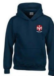
YOUTH HOODED SWEATSHIRT

Parish News: "What's the deep longing in our hearts?" Please see the link to explore this question and learn more. Click Here